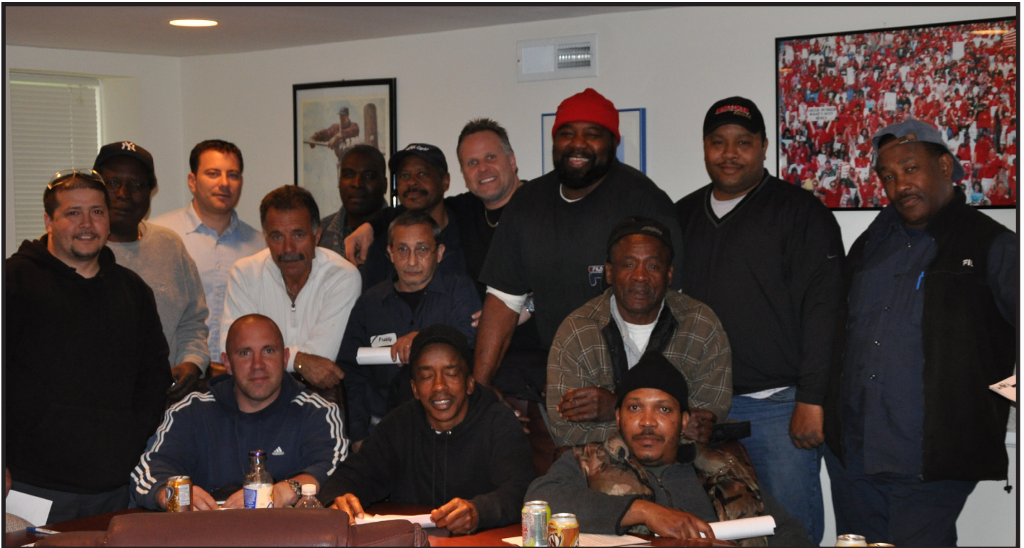
These CWA Local 1103 Members were organized through majority Card Check . An overwhelming majority of US Employers refuse to recognize employees desiring to join a union who exercises this section of the NLRB union election process.